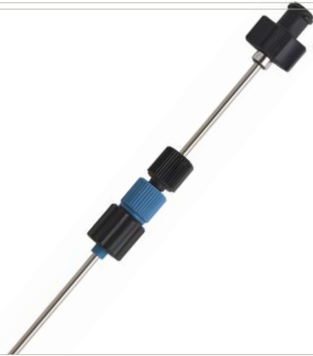
13.5G Cement Conduit